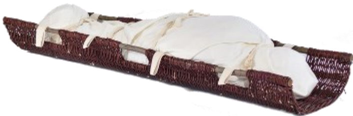
Bamboo shroud and willow stretcher £482