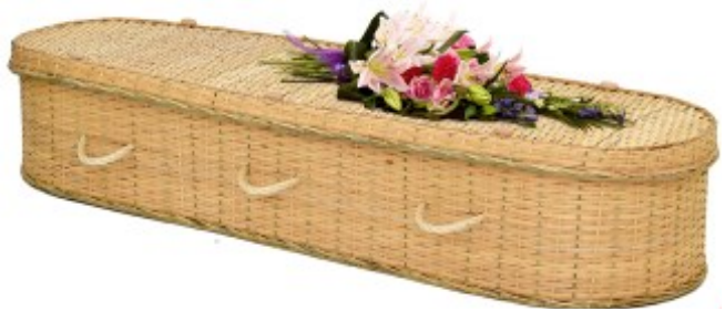
Round and Traditional £373

Bamboo coffins in many different styles: woven from sustainable and flexible straw-coloured bamboo cane, with a light-green natural hue.