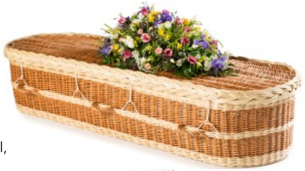
English Willow Round and Traditional, various colours £712

English willow coffins in different styles and many colours: handwoven from sustainable willow grown on the Somerset levels, colours created by natural methods of drying, boiling or bark stripping.