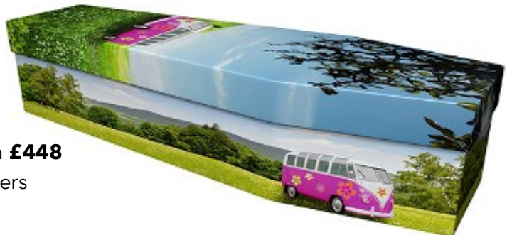
VW camper van £448 - plus many others