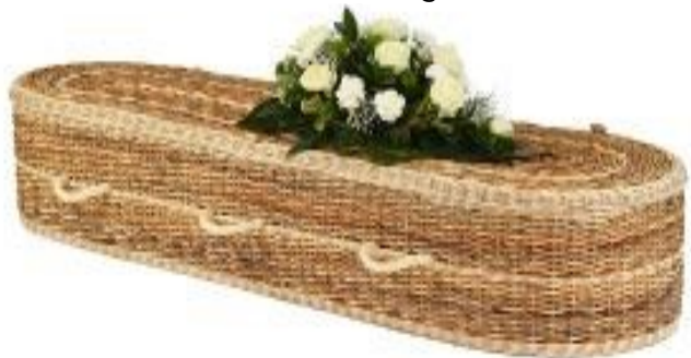
eco2 Round and Traditional £479

Banana coffins: made from flexible and strong golden-brown banana cord, woven around a natural cane and light rattan framework.