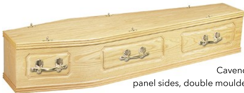
Cavendish oak panel sides, double moulded, solid £708