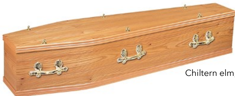
Chiltern elm, veneer £323