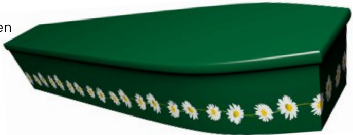
British Daisy Green £675