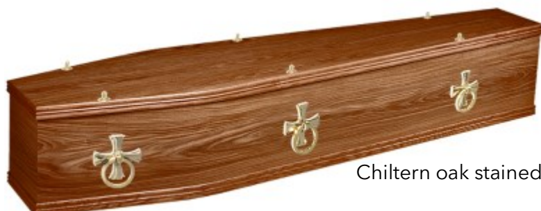
Chiltern oak stained, veneer £347