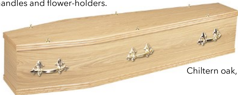
Chiltern oak, veneer £323

Wooden coffins in different styles and many colours: prices include handles and flower-holders.