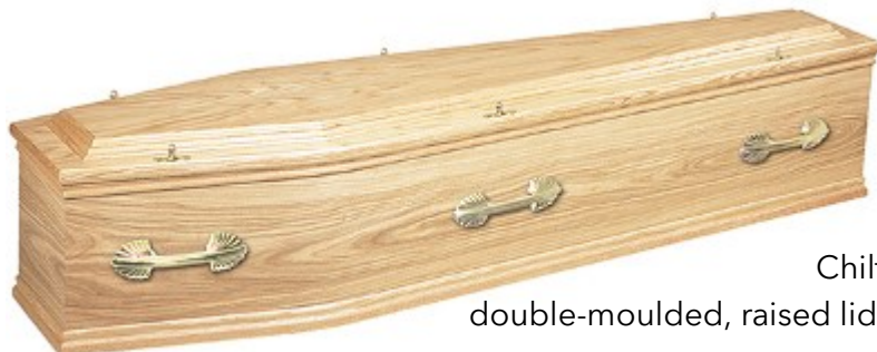
Chiltern oak double-moulded, raised lid, veneer £440