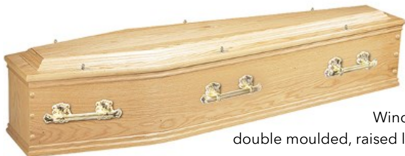
Windsor oak double moulded, raised lid, solid £695